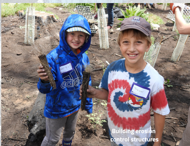
Building erosion control structures