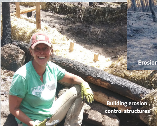
Building erosion control structures