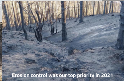
Erosion control was our top priority in 2021