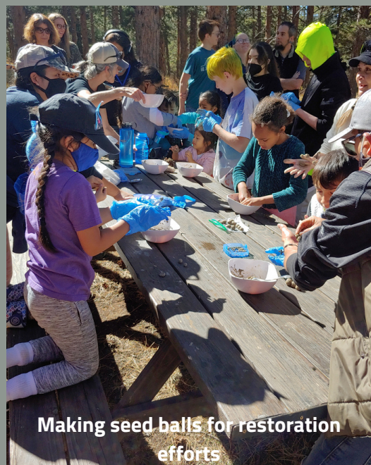
Making seed balls for restoration efforts